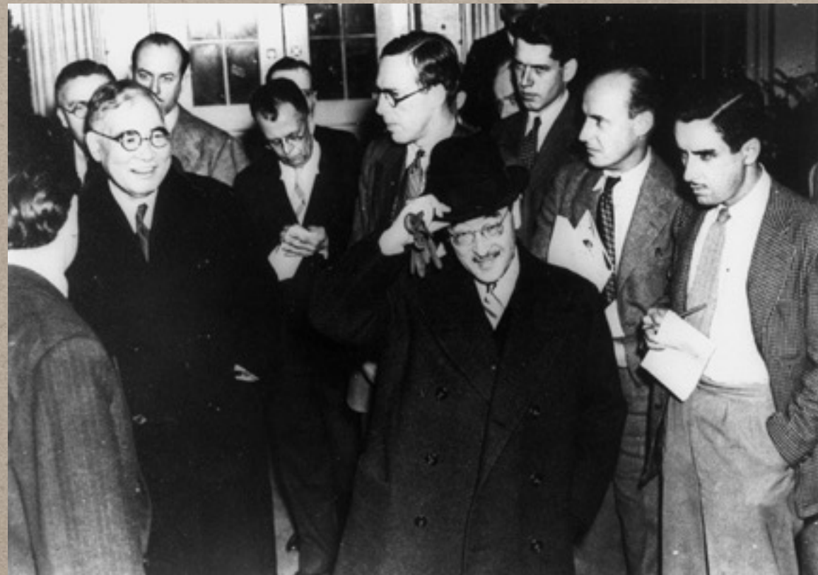
Japanese Ambassador Admiral Kichisaburo Nomura and Special Envoy Saburo Kurusu after meeting with US President Roosevelt, White House, Washington, DC, United States, 27 Nov 1941