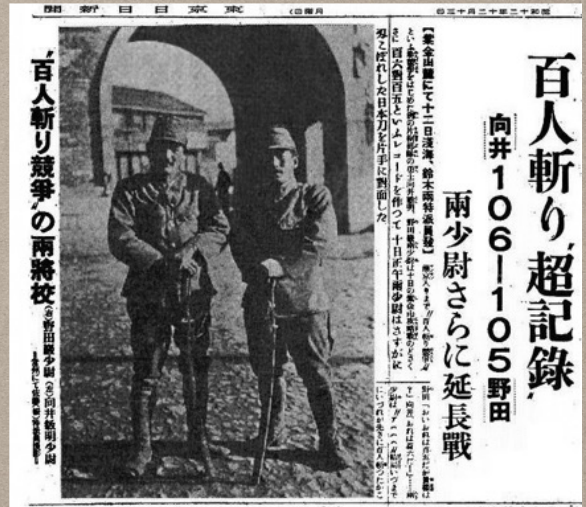
The headline reads, "'Incredible Record' (in the Contest to Cut Down 100 People) –Mukai 106 - 105 Noda–Both 2nd Lieutenants Go Into Extra Innings"